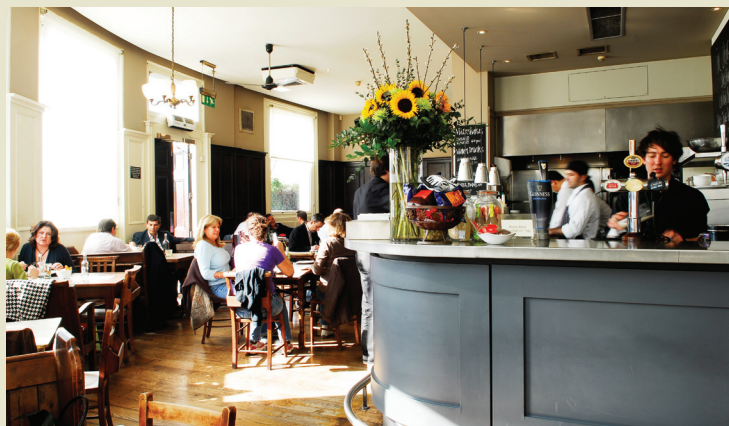
Mission: Food & Fuel aims to provide fresh, seasonal and delicious food

The research reveals a perhaps unsurprising perception that staff training in pubs isn't as rigorous as in restaurants and that this is a direct result of higher staff turnover in the pub trade. When asked about their