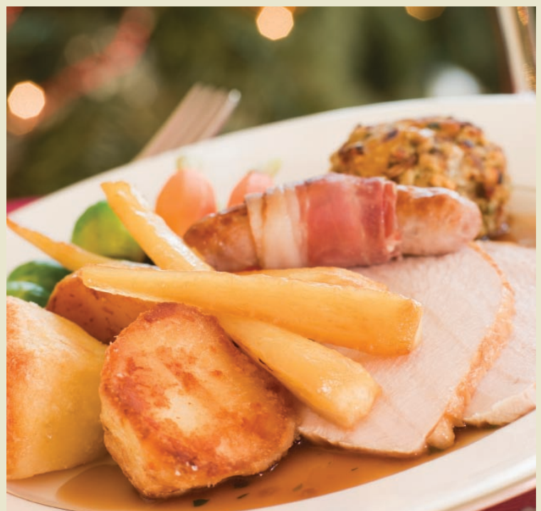
Festive fare: a traditional Christmas meal is favoured by 59% of diners